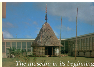
The museum in its beginning